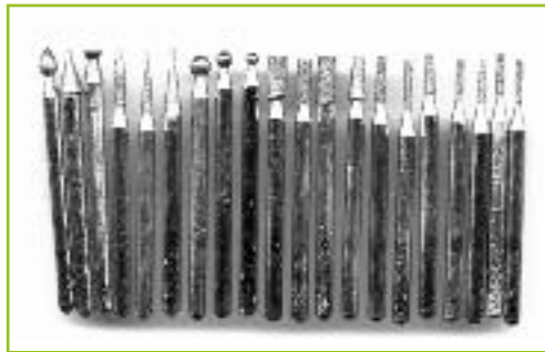
10 pc large $8.50/set Special! $7.50/20pc set (Shown inside back cover) (as shown above)