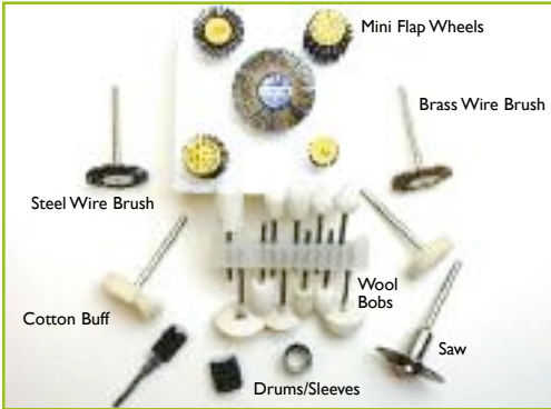
Accessories for Rotary Tools 5 pc Mini Flap Wheel Set $20.00 (above)