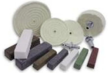
*2" & 3" Cotton Buffs see photo inside back cover

Metal workers, foundries, knife makers, gunsmiths, and wood carvers (honing chisels) use these products for finishing. Buffing wheels, made from 40 plies of cotton sheets, are sewn together in three degrees of stiffness: SPIRAL SEWN-HARD —1/4" tightly sewn is a good general-purpose wheel for coarse buffing. CUSHION SEWN-MEDIUM —sewn with concentric circles about 1/2" apart is good for cutting and coloring action. LOOSE SEWN-SOFT —sewn with only about 2 concentric circles. Extra soft for final coloring. This is the safest wheel to use with rouge on precious metals. Buffing wheels are about 1/2" thick and can be gang mounted side by side to achieve say 1" or 2" face widths. They have 1/2" arbors which can be mounted on a bench motor, drill press, or on our 1/4", 1/2", or 5/8" wheel adapter mandrels ($6.50 each), available with left or right turn threading.