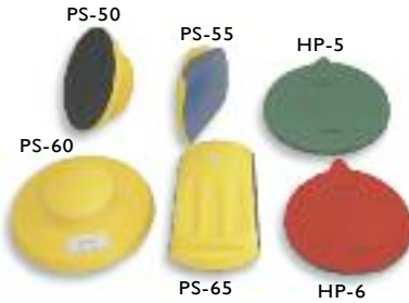
FOAM HAND PADS

Try our ergonomically designed hand pads which accept 5" and 6" discs and have molded recesses for 3 fingers. We have 5" and 6" round soft foam hand pads with an elastic strap for sanding contoured shapes. We also have semi rigid yellow foam 5" and 6" hand pads with molded handles for flat surface sanding. Prices are for PSA. Please add $1.00 each for H & L surface. Our yellow (medium grit) and black (fine grit) H&L hand sanding kits are essential in every wood shop.