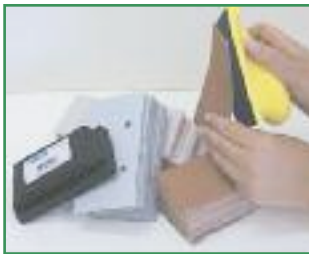
YELLOW (MED-FN) & BLACK (FN-VF) H&L SANDING KITS